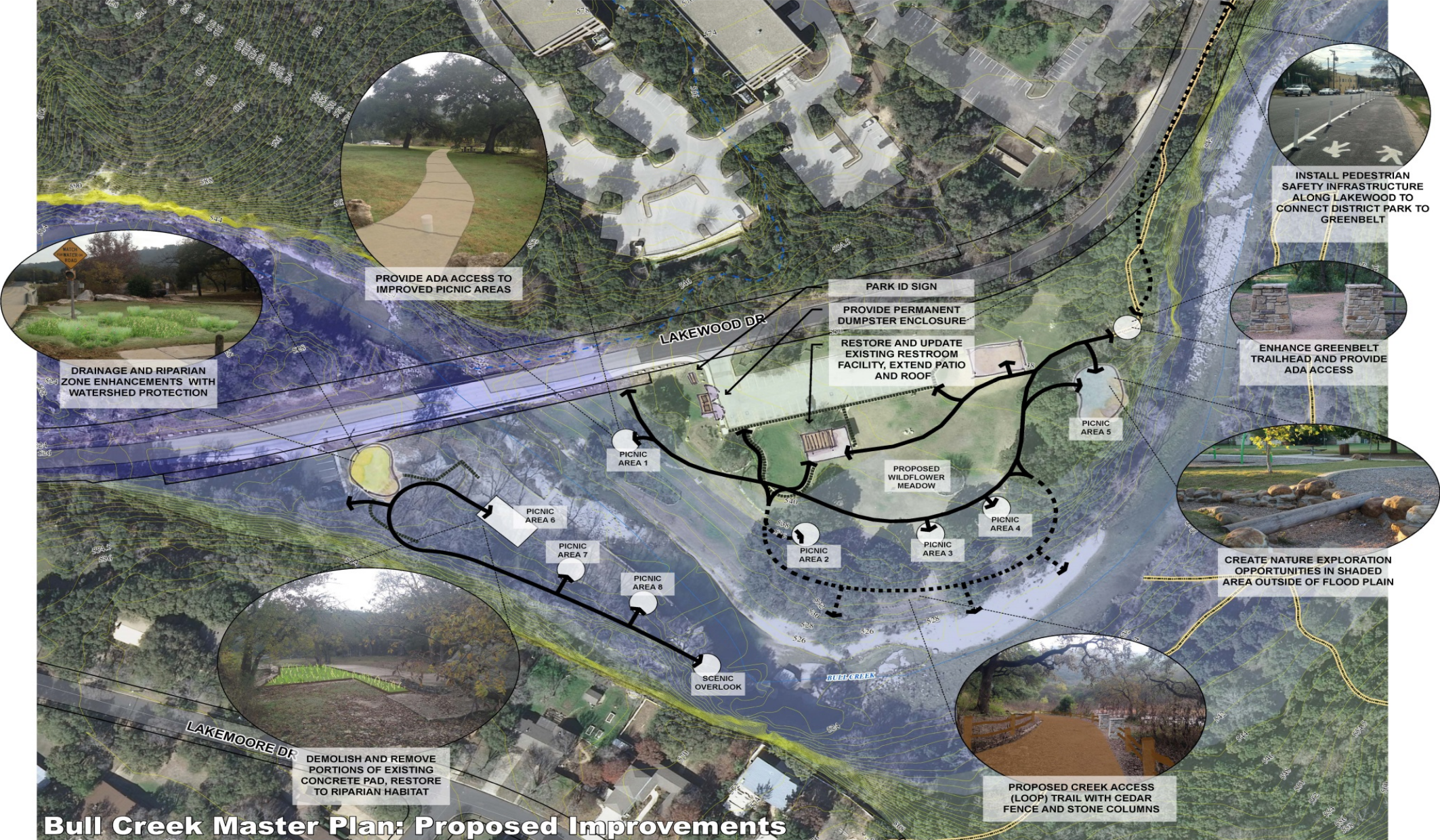
Bull Creek Master Plan: Proposed Improvements